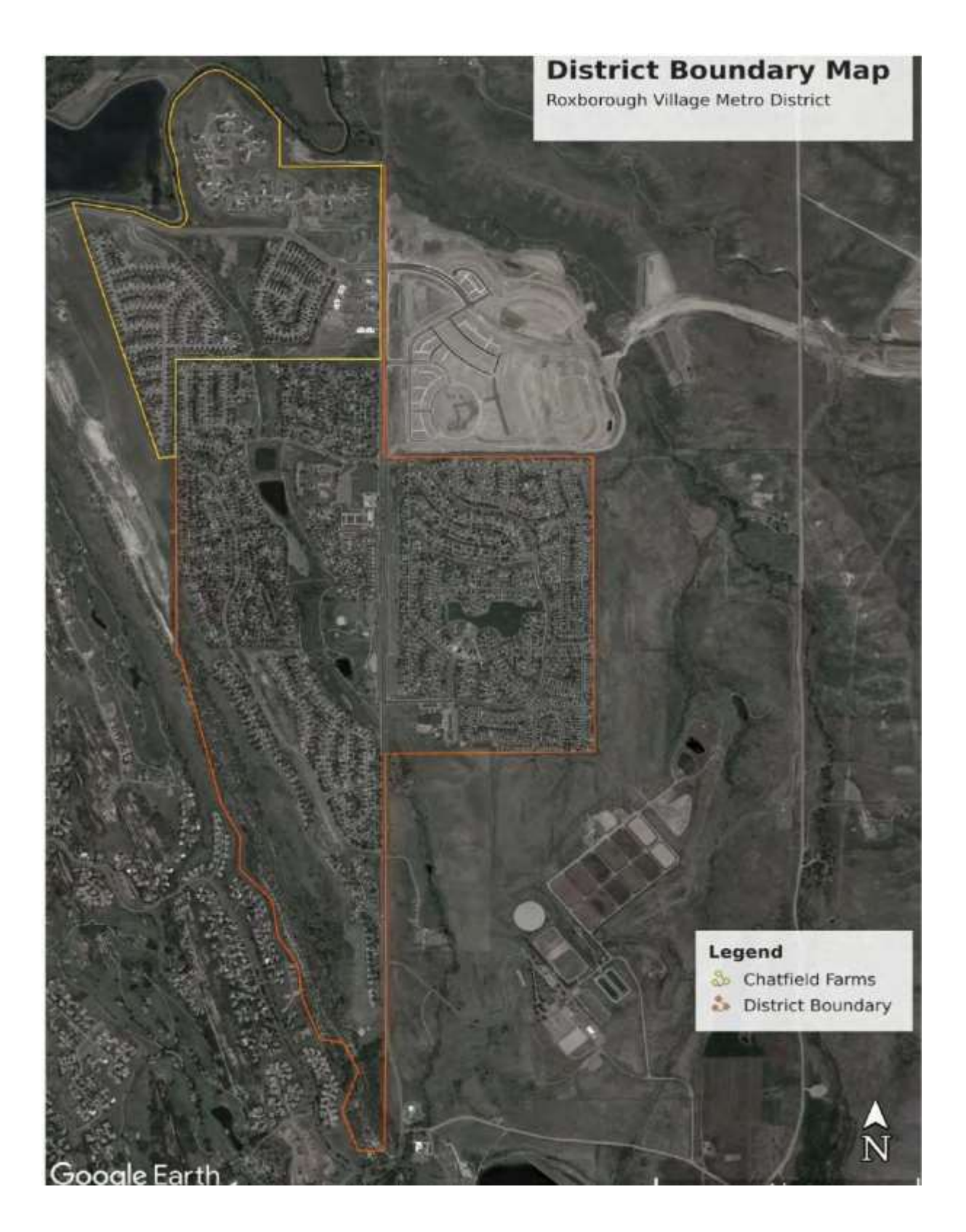
EXHIBIT A DISTRICT BOUNDARY MAP